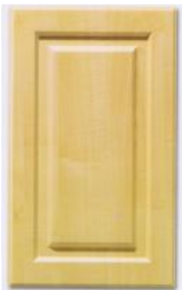
Woodgrain Thermoform Door illustrated